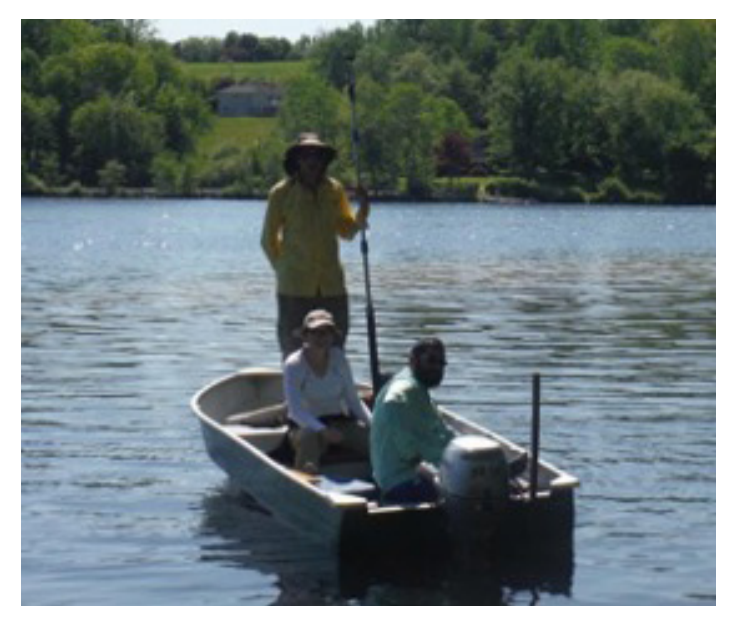
Invasive Aquatic Weed Survey Crew

Curly-leaf pondweed has a unique reproductive habit and an aggressive growth cycle. CLP starts growing early in May reaching maturity by early July. By late July and certainly by August, the plants die back and are gone and out of sight until they re-emerge with vigor again in September. Just one plant can produce 50 new plants. The plant's primary mode of reproduction is to release turions, or hardened shoot tips (winter buds) that sprout and grow a new shoot and root. Each mature plant can form many of these turions (see photo on page 3). The turions float and drift, driven by the prevailing winds to different parts of the Lake. Eventually the turions waterlog and sink where the tiny rootlet establishes a new plant and a new population center. By 2014, CLP populations expanded to 120 locations in seemingly all corners of the Lake.