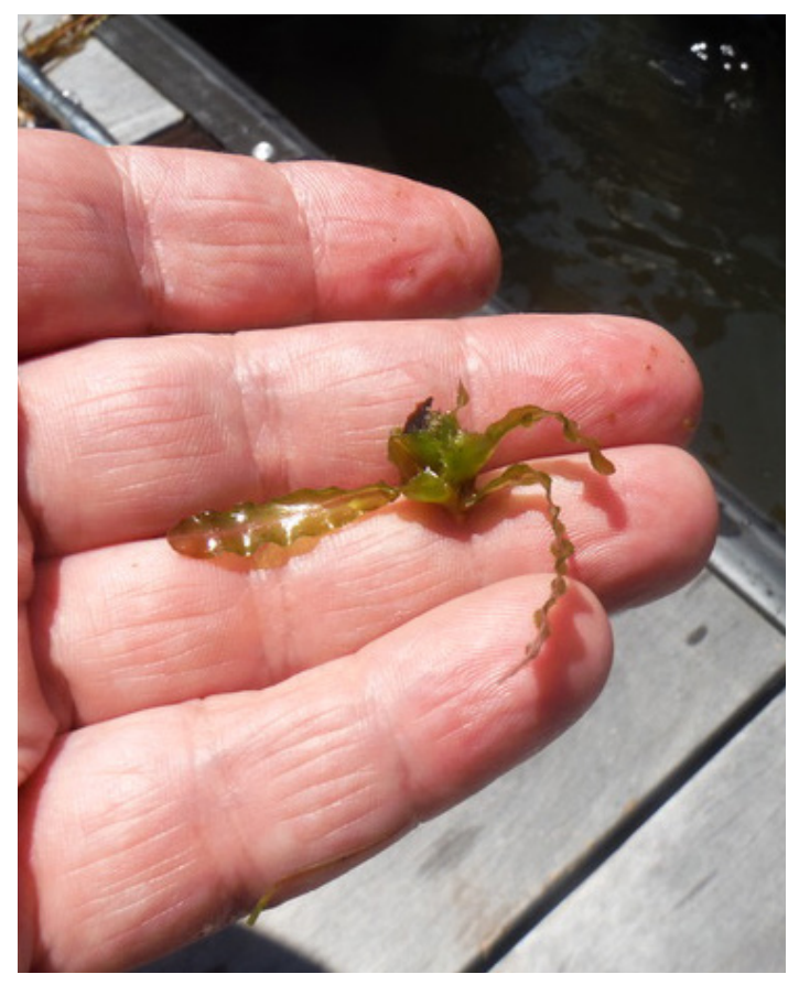
CLP Turion Breaks off from Plant and Starts a new Population Elsewhere

the plants first start to grow since every lake is different. Their survey consisted of traversing the entire littoral zone (shallow water shoreline zone) of the lake, with particular attention given to locations where CLP has been found in previous years. This survey methodology of utilizing a combination of visual assessments,