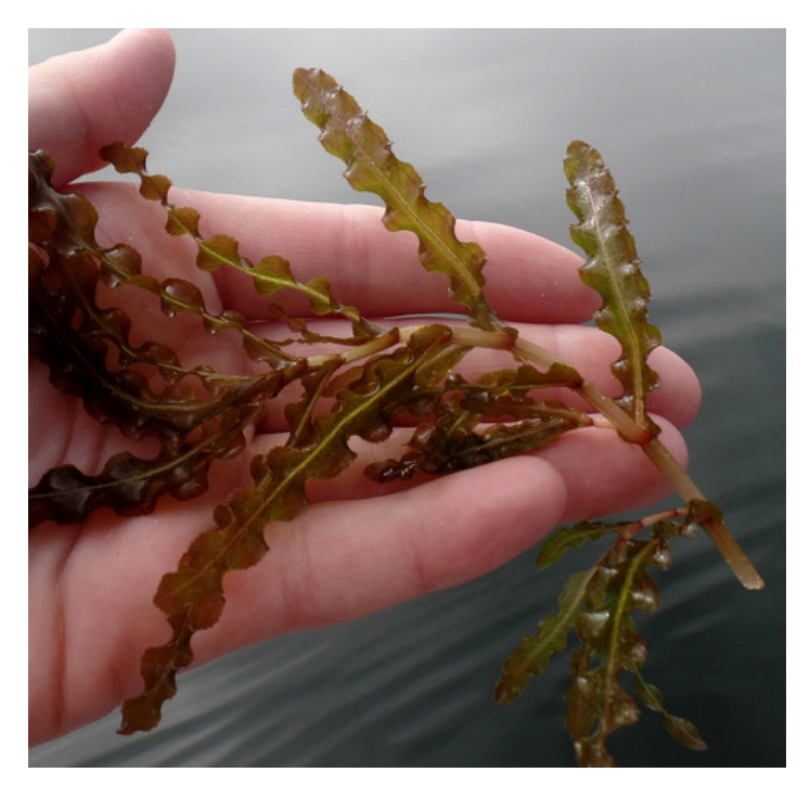
Mature Curley leaf pondweed

Our efforts have paid off! Lake Waramaug is the only Lake in Connecticut that has been successful in controlling and nearly eliminating all non-native invasive aquatic weeds without the use of herbicides . Our goal has always been to avoid the use of herbicides. That way, we keep the water in the Lake clean, clear and swimmable.